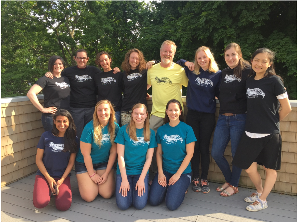
AQUAVET® II Class of 2018