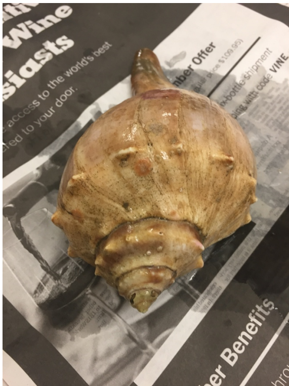
Invertebrate Wet Lab