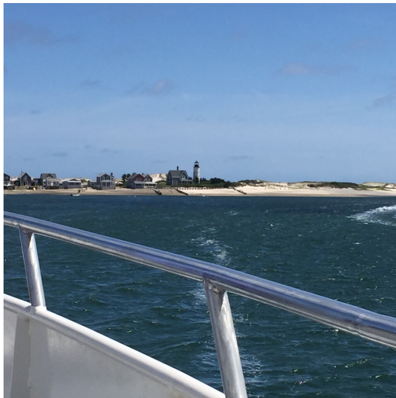
Whale watching field trip, Sandy Neck, Rhode Island USA