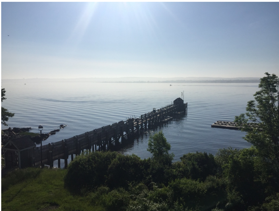
Roger Williams University campus, Rhode Island USA