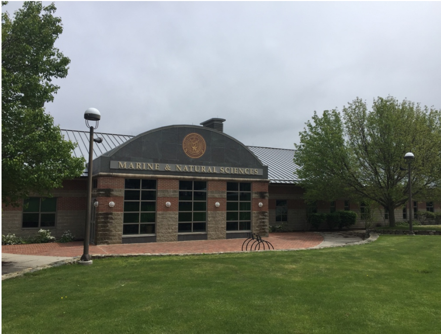
The Marine and Natural Sciences building, Roger Williams University, location for AQUAVET® II classes