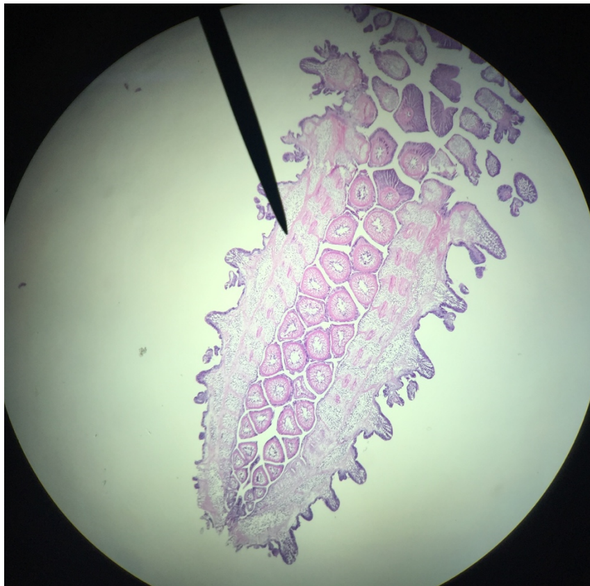
Invertebrate slide viewing