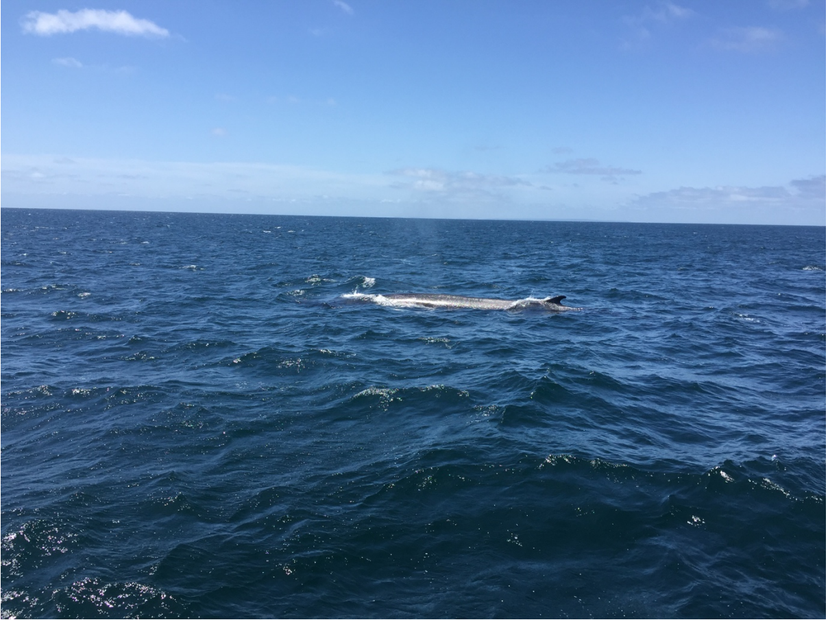
Finback whale, Cape Cod USA