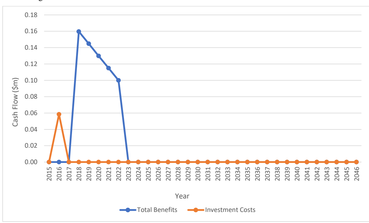
Figure 2: Annual Cash Flow of Undiscounted Total Benefits and Total Investment Costs