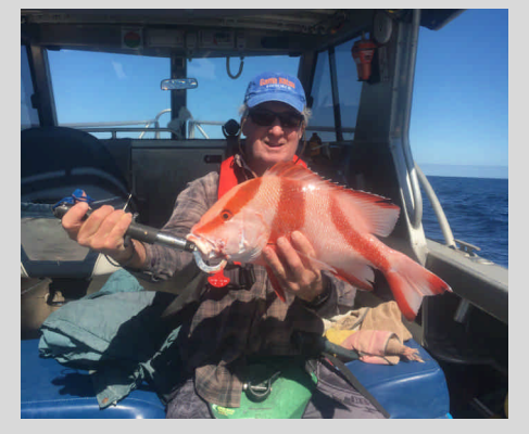
Red emperor ( Lutjanus sebae ) caught off Green Head, WA – 50m of water, 16km offshore.