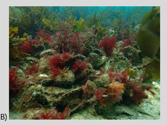
Shellfish reefs provide important fish habitat but where largely wiped out during the late 1800s through dredge fishing, poor water quality and sedimentation. (A) remnant shellfish reef, Port Phillip Bay, Victoria (B) Native flat oyster reef, St Helens Tasmania