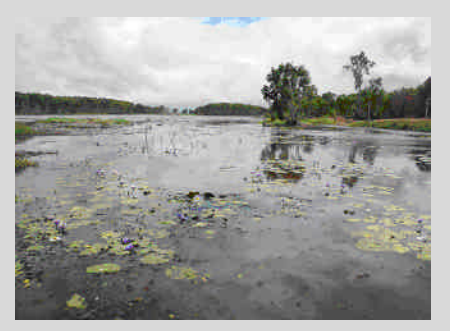
Then and now: (a) the massive infestation of weeds of national significance, before the bund was removed; (b) the enormous reduction in these weeds only two years after the bund was removed.

The successful restoration of the Mungalla wetlands is due to the combination of indigenous ownership and management with scientific monitoring and modelling – an approach that could well be applied to many of the still degraded coastal wetlands in north Queensland.