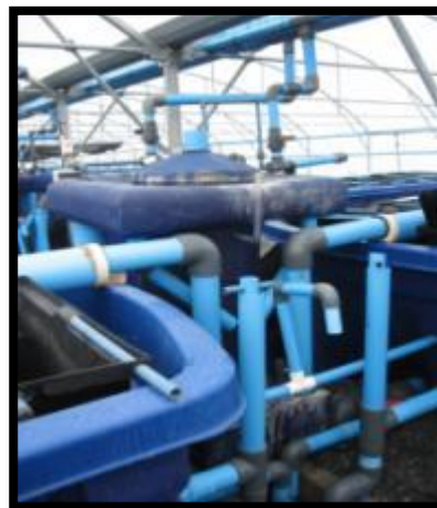
Figure 19: Abalone grow-out airlift system