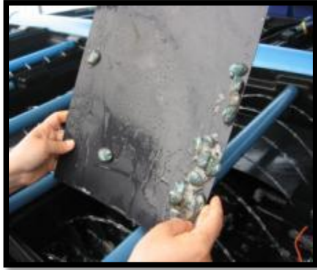
Figure 12: Abalone recirculation system