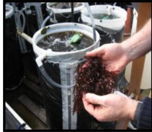
Figure 15: Seaweed investigated for anti-microbial properties

The use of seaweeds in abalone culture could improve the ability to recirculate or re-use water without the need for UV sterilization, as seaweeds can not only reduce bacterial levels, but certain seaweeds can be selected to target known pathogens, identified through pathology testing. Cheng et al. (2004) showed that high water temperature causes a reduction in phagocytic activity (one of abalones' limited non-specific immune defences), leading to susceptibility to Vibrio and other bacterial infections. A well known specialist in health management in marine hatcheries, Ralph Elston (at 'Aquaculture 2010') described vibriosis as a recurrent problem in marine hatcheries, and stated that so far there is "no magic fix for vibriosis". In the absence of a suite of treatment options in the event of a bacterial outbreak, the combination of feeding seaweed to aquatic animals and maintaining a stable and diverse population of bacteria can help to reduce the proliferation of pathogenic bacteria which can gain a foothold in stressed animals. Figure 15 shows that a small experimental unit can be suitable for various studies.