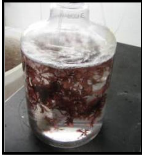
Figure 4: Aerated/tumble culture of Palmaria palmata