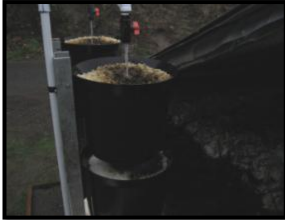
Figure 14: Biofilter for stabilizing bacteria in a marine system