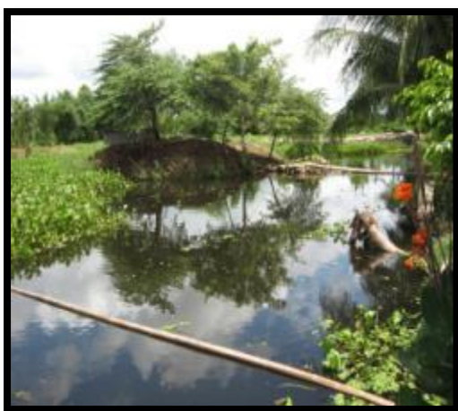
Figure 22: Poly-culture in the Philippines

IMTA production is not a new concept. For centuries, pond poly-cultures have supplied a food source for rural communities throughout China and many other Asian countries. Figures 22 and 23 show poly-culture ponds in the Philippines and China. In these particular systems, chickens or geese are fed, with their waste providing nutrients for microalgae, which in turn provide a feed source for herbivorous and/or omnivorous fish. Products from these systems can include; poultry, plants (e.g. lotus), fish and freshwater crustaceans.