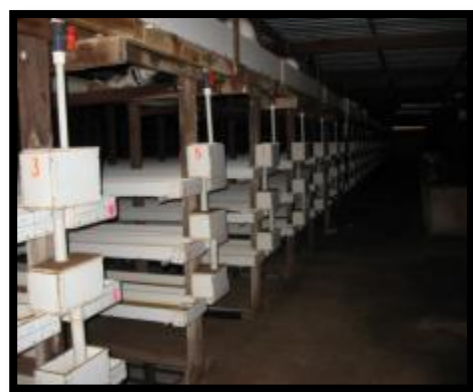
Figure 21: SAABDEV raceway system (2)

Urchins present another opportunity for SAABDEV. Urchin roe receives a high price on the Japanese market at around $1200/kg (wholesale). Wild harvest of urchins is not considered