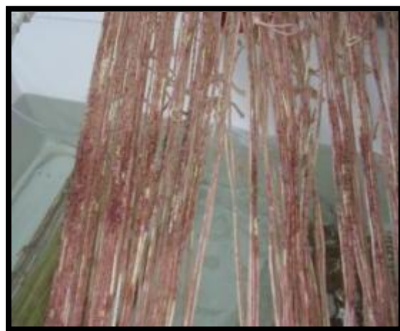
Figure 2: Sporelings of the red seaweed Palmaria palmata

In Ireland at the Martin Ryan Institute, fertile fronds of Palmaria palmata are induced to spawn by simply desiccating the seaweed and then placing these fronds back into seawater. Once the seaweed has ‘spawned’, spores are collected and simply using a spray bottle can be set to ropes for sea deployment (Figure 2).