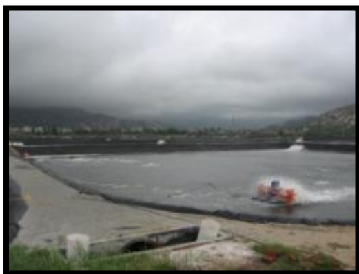
Figure 16: Prawn farm in China using well water

Ozonation is expensive, but in some cases, costs could be offset by a reduction in stock cover insurance premiums. At some sites, saltwater wells can be used as a source of water for ozonation. A lower ozone rate is suitable for very clean water. Figure 16 shows a prawn farm in China. This farm draws 20 litres per second from an underground well. On the day we visited, the sea appeared a coffee colour (figure 17), whilst incoming water was completely clear.