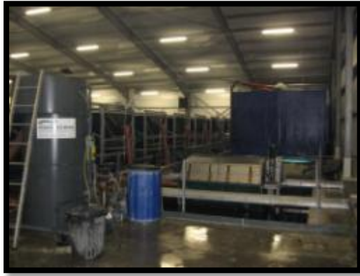
Figure 11: Water treatment system for an abalone farm in southern Ireland

Flow-through systems have several distinct advantages over re-use and recirculating aquaculture systems. Provided the aquaculture facility is located in an oceanic site, water of consistent quality can generally be relied upon. So, why recirculate water when a continuous supply of high quality water can be pumped ashore into flow through systems?