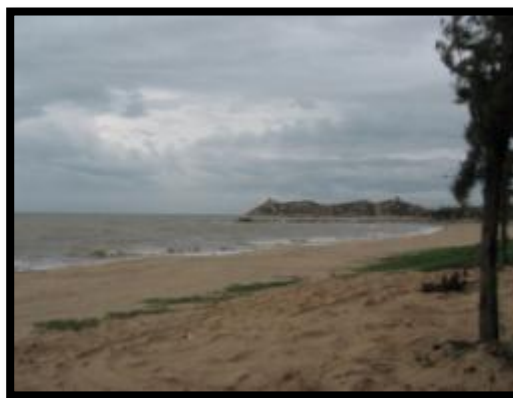
Figure 17: Prawn farm- ocean at site