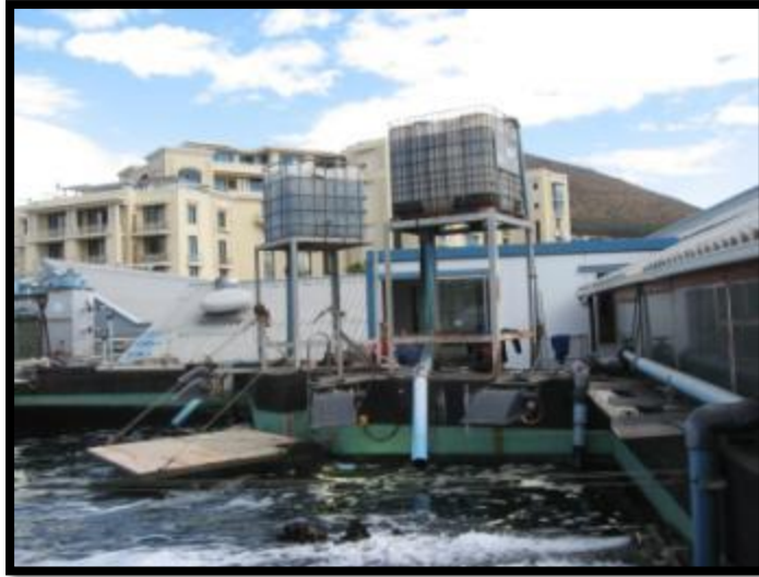
Figure 3: Flushing devices and water movement systems at the Cape Town Aquarium

This study focused on two systems for the production of seaweeds, including aerated tank culture and large paddlewheel raceways/ponds. A method of production involving large, lined ponds was considered, but this method appears difficult to manage and evidence suggests that productivity is low per unit area compared with other systems. Deep aerated tanks can be used to grow a range of seaweeds, including many red species that are consumed by abalone. Paddlewheel ponds arguably present a minor breakthrough in the production of large quantities of ‘fleshy’ type seaweeds at low cost compared to other systems.