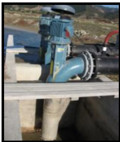
Figure 18: Axial flow propeller pump

Abagold produces up to 350t of abalone per annum and is the largest abalone farm outside of China, employing 250 workers. Power is their primary running cost due to the need to pump over 2,000 litres per second to adequately supply its flow through operation. In contrast to pumping water direct from the ocean, recirculation of water on site provides the opportunity for a greater number of water distribution options. The slab tank raceway systems predominantly utilized for abalone culture in Australia are situated at ground level. Recirculation systems can be designed to minimize both pumping heights and frictional head losses as water does not need to be pumped long distances from sea level. At low head heights, axial flow propeller pumps are particularly suited to reticulating water at a lower electricity cost. These pumps (figure 18) were observed in both New Zealand and England where they are used to move high volumes of water between aquaculture ponds. Also, through the displacement of water via air, air lift systems are known to be a cheaper way of pumping water at low head heights compared to centrifugal pumps and have the added benefit of providing aeration. Connemara Abalone in Ireland uses a South African grow-out system to produce abalone for the European market. All water is recirculated via airlifts (figure 19). No pumping is required apart from drawing top-up water from the sea.