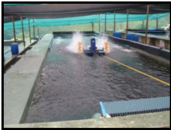
Figure 24: Semi-recirculating trout farm in South Africa

The Fizantakraal fish farm in South Africa grows trout in a semi-recirculating system (Figure 24). This system includes both recirculation and water cascading. Water is recirculated within individual raceway systems using airlifts. A simple system using a gate controls how much water is exchanged and is dependent on ammonia concentration as no biofilter is used in the system. This type of model is one that could be used to integrate abalone and seaweed culture. Abalone waste water directed to paddlewheel ponds or other seaweed culture units could be returned (using low cost pumping methods) only when parameters were suitable. For example, during daytime when seaweeds produce oxygen, some of this water could be directed back to the abalone, resulting in a reduction in pumping costs and increase in oxygen levels to the abalone culture system. Also, elevated carbon dioxide levels in abalone water can benefit seaweed culture units. Seaweeds at-least have potential to form part of a water treatment system and it is clear there are many potential ways in which integrated abalone/seaweed culture can prove viable.