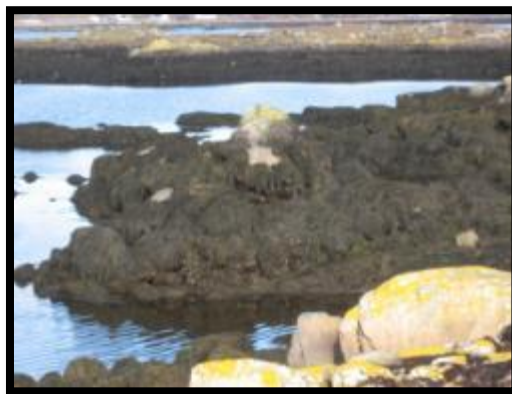
Figure 1: Natural growth of Ascophyllum sp. near Galway, Ireland

Even if regulations change in Australia and it is possible to harvest seaweed from local sources, seaweed culture on land is likely to be the preferred method for obtaining seaweed biomass. This is for a number of reasons, including the fact that Australia's marine waters are generally oligotrophic (low in nutrients) and do not support large seaweed productivity, and that collection and transport would be a costly exercise compared to on-site production. In comparison, in Ireland, ocean upwelling brings nutrients to inshore waters, where large biomass of seaweeds is obvious along the coastline. Figure 1 highlights the productivity of the seaweed Ascophyllum sp.