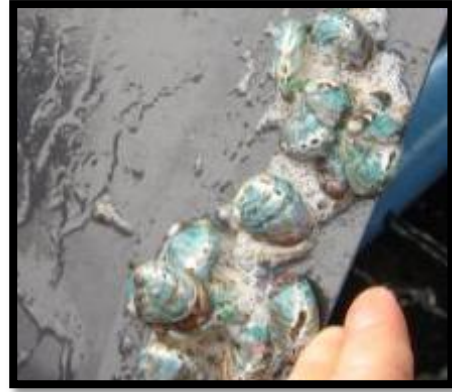
Figure 13: Close-up showing shell wastage caused by dissolution of calcium carbonate at low pH