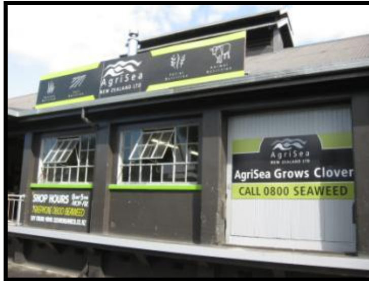
Figure 8: AgriSea produces a range of products from Ecklonia maxima

improving animal nutrition. Sales have increased in recent years as dairy farmers in New Zealand have observed the benefits in providing a seaweed extract to dairy cows which have become sick due to nutritional deficiencies.