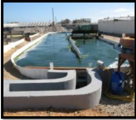
Figure 5: Paddlewheel culture of Ulva .