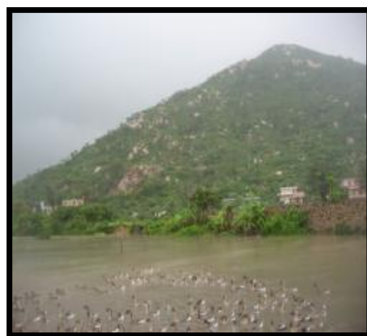
Figure 23: Poly-culture in China