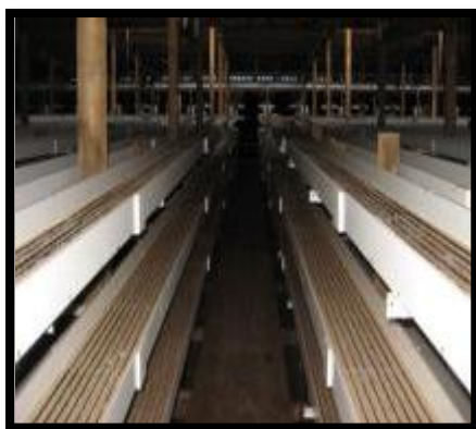
Figure 20: SAABDEV raceway system (1)

Considering that such a short period of temperature reduction is required to prevent mortality outbreaks, the ability to recirculate water with minimal RAS infrastructure is a viable option. The combination of heat/chill pumps and insulation would be the main investments needed to maintain a low temperature. As the site is located on sand, bore water is available at full strength salinity. The bore water reaches a maximum temperature of around 21.5 0 C in summer compared to an average maximum of 26 0 C at sea (adjacent to the farm). A suitable volume of water could be obtained from a relatively large seawater well on site to assist with temperature control. Figures 20 and 21 show raceway design of the abalone grow-out system at the farm.