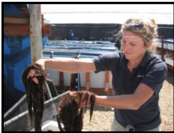
Figure 7: Gracilaria culture in South Africa

A number of trials around the world have shown that abalone fed mixed diets grow better than single species diets. The red seaweed Gracilaria spp. has good potential for culture as a supplementary food source for abalone. Gracilaria spp. tolerate higher temperatures than many other red seaweeds found in oceanic waters, making them a suitable culture species for outdoor production in southern Australian locations which can experience maximum temperatures over 40 0 C. Another red seaweed, Palmaria palmata can contain over 30% protein and is grown in tumble culture tanks for feeding abalone. A large abalone farm in Hawaii, Big Island Abalone, reportedly produces the largest quantity of red seaweeds grown in land-based tank systems in the world. Whilst Palmaria sp. is an ideal abalone food, this species prefers cooler water and was observed on the study trip in cooler parts of the world, including Ireland and Oregon in the U.S. Fortunately, red seaweeds grow in a range of environments and tolerate a wide range of temperatures. Gracilaria (figure 7) is cultured in South Africa for abalone food and also in tropical locations for the production of agar.