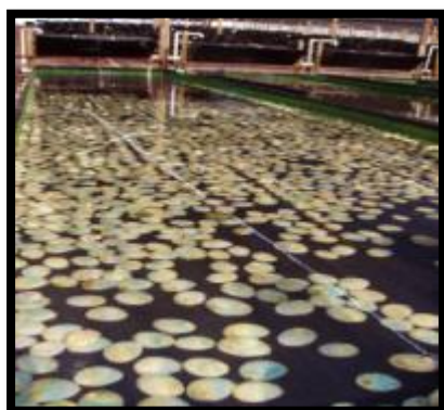
Figure 9: Shallow raceway culture in Australia

Australia and figure 10, the plate/aerated tank method which is prevalent in overseas land-based abalone culture systems.