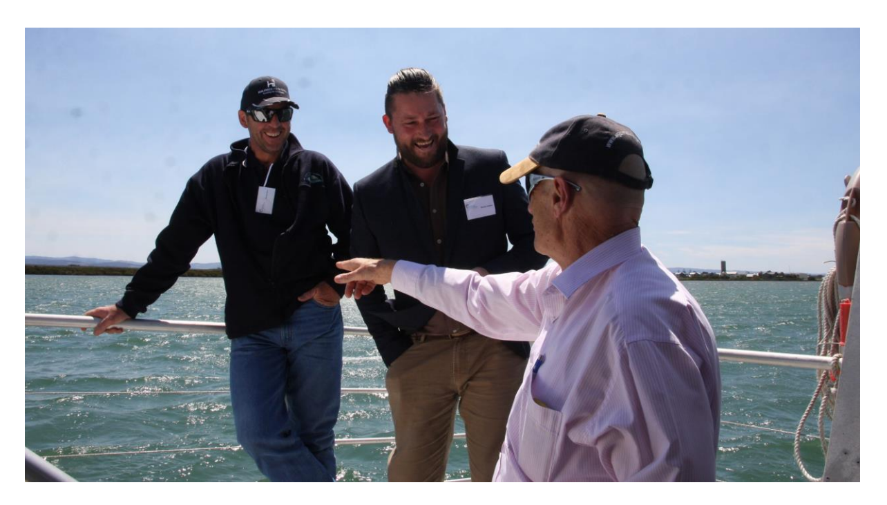
Figure 7: Participants enjoying the boat trip