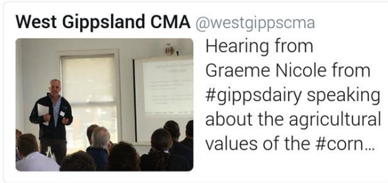
11:02 AM · 04 Nov 16

Great to see @Dairy_Australia on board with collaborative catchment management to protect #fishhabitat in #cornerinlet